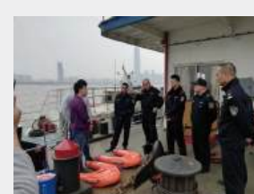
Ports & Harbour Authority