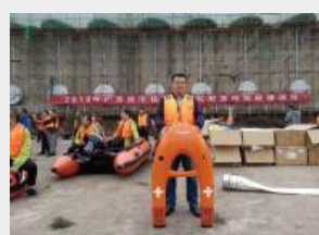
Mobile Rescue Team